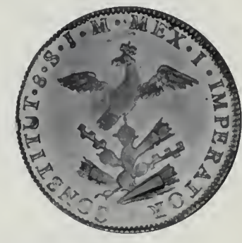
Lot No. 2396

8 Escudos, 1822 Mo-JM. 1st Type. Obv. Long, narrow bust with curved truncation. Emperor's name 2396 spelled AUGUSTINUS. Rv. Crowned eagle perched on cactus. KM 313.1, Fr.59. The coin has had only light wear, but is weakly struck in the centers. Somewhat prooflike and attractive. Nice (2,250-2,750)Extremely Fine.